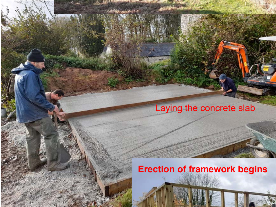
Erection of framework begins