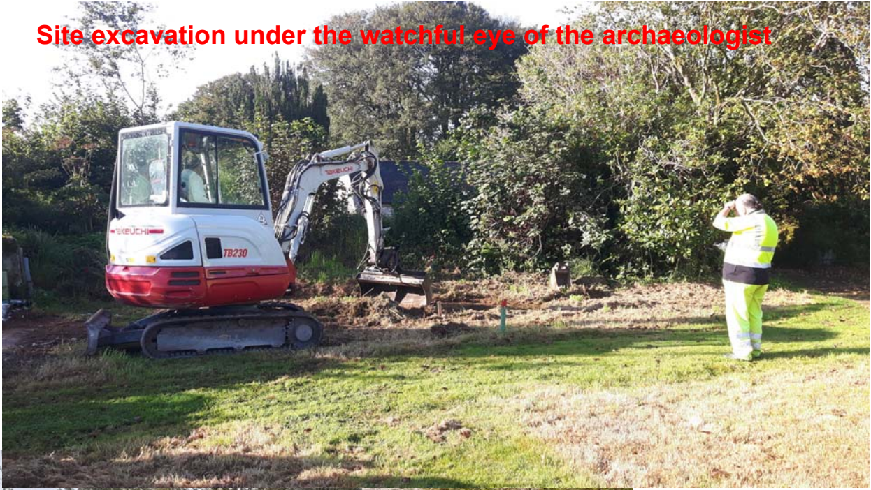
Site excavation under the watchful eye of the archaeologist